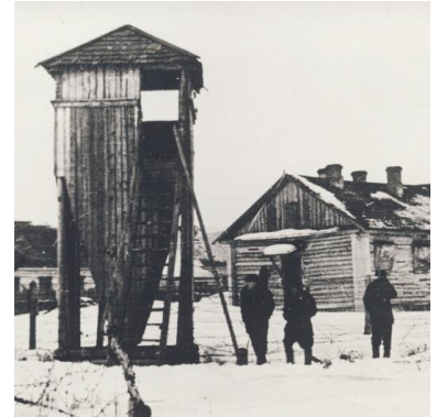
Gulag concentration camp, winter.

Using forced labour to build the economy of the state – free labour, using people in the interest of the state. How the Soviet Union used prisoners of the Gulag as free labour to build economy of the state.